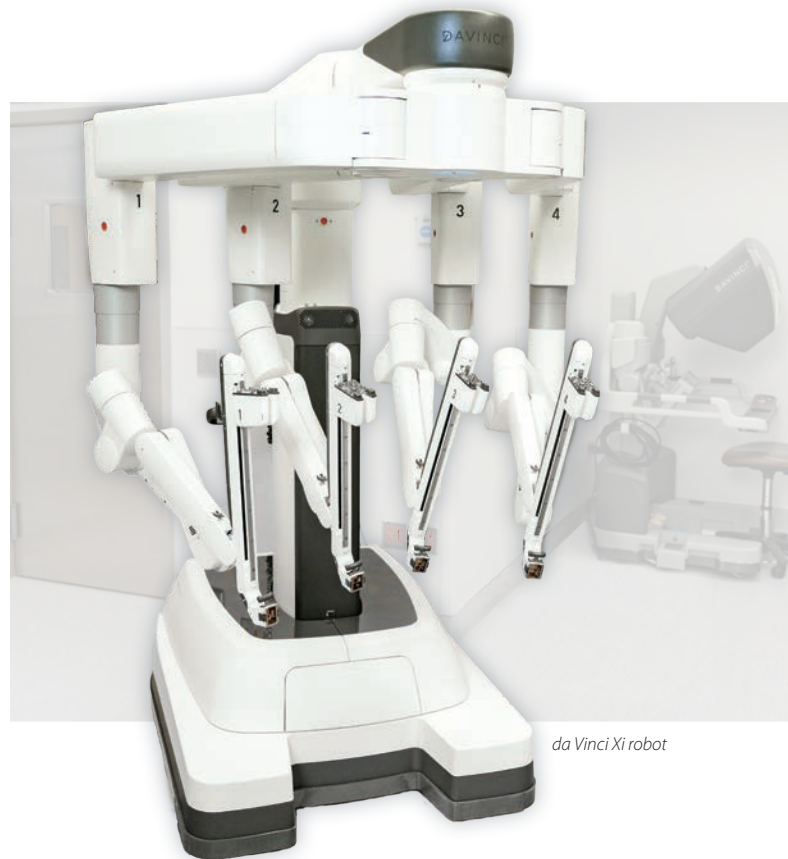
da Vinci Xi robot